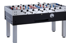
➤ Garlando (Italy) www.garlando.it