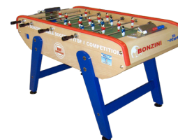
➤ Bonzini (France) www.bonzini.com