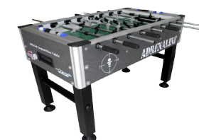
➤ Roberto Sport (Italy) www.robortosport.it