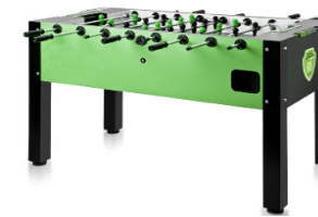
➤ Leonhart (Germany) www.original-leonhart.com