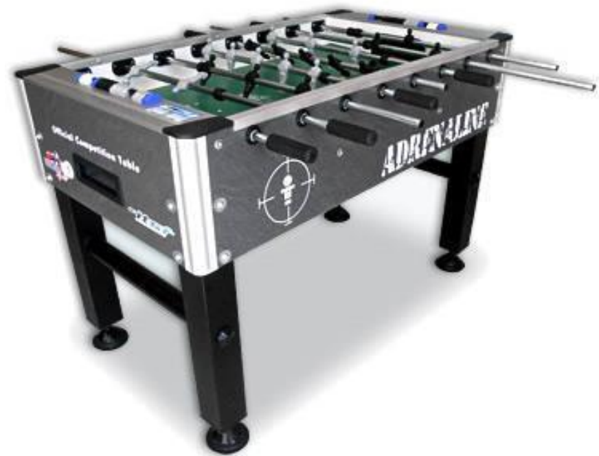
The Main Prize of Balkan Cup – Foosball table Roberto Sport Adrenaline!

Champions League is a separate discipline, that will be organized on the 3 rd Balkan Cup tournament in Serbia. The four best contestants on a common ranking of Balkan Cup, after the tournament, will have the honor to select a team of four players, with whom they will compete for the grand prize of Balkan Cup – football table Roberto Sport Adrenaline . Optional – If a state (Cro, Slo, Srb) does not have a representative among TOP 4 , then the best from that country (regarding his number of points) gets into the game.